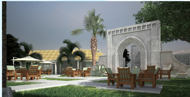
Gede Themed coffee shop