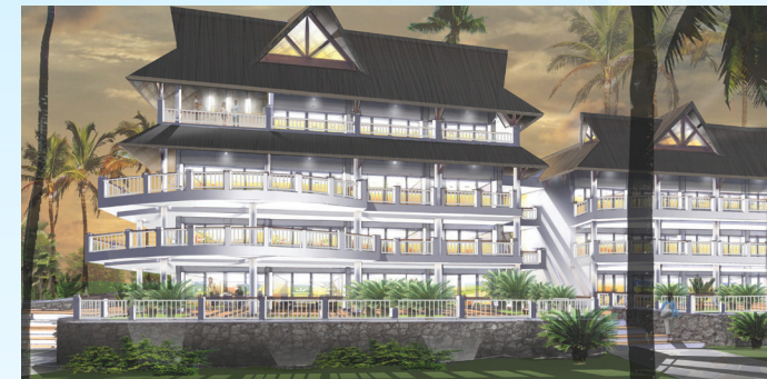
Evening view of The Residences

Construction completion date is October 2017