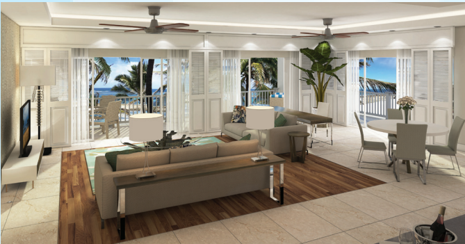
Open plan living room