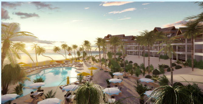
Guest areas in front of the Residences

We expect to re-open the hotel for a soft opening around Easter 2017 with the entire construction project being completed by October 2017.