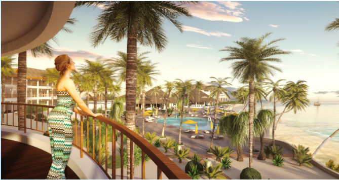
Ocean view from The Residences looking North