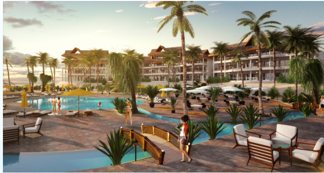
New Guest areas - terrace and pools